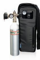
Medium cylinder bag 1065702